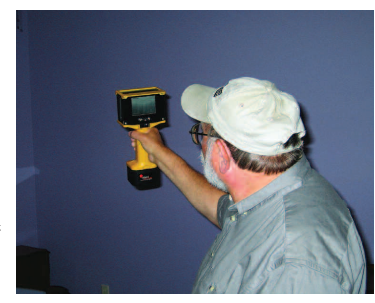
Infrared cameras can help energy auditors pinpoint areas of air loss.

And don't forget about applying weather stripping around your attic hatch or pull-down stairs. You may also want to install an insulator box to place over the opening. You can build your own or check the home improvement store for a premade model.